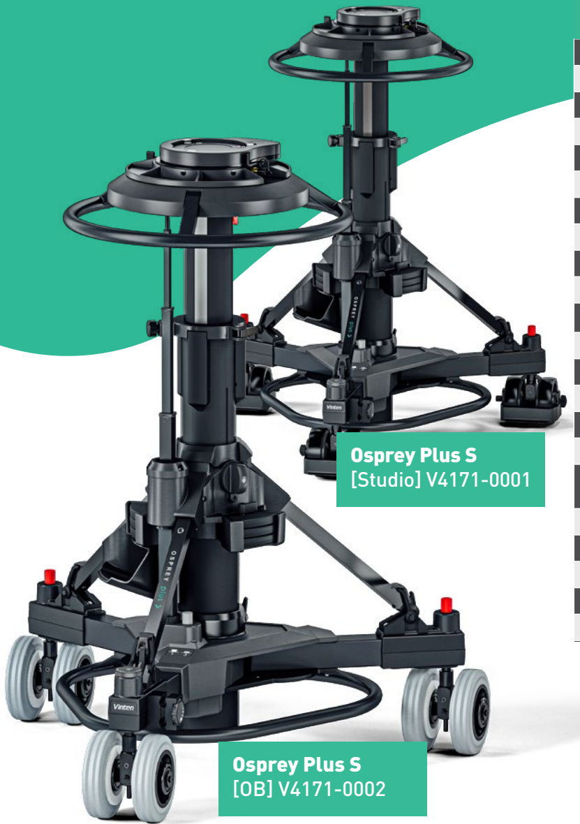
Osprey Plus S [Studio] V4171-0001