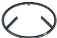
Steering ring, large 3429-21