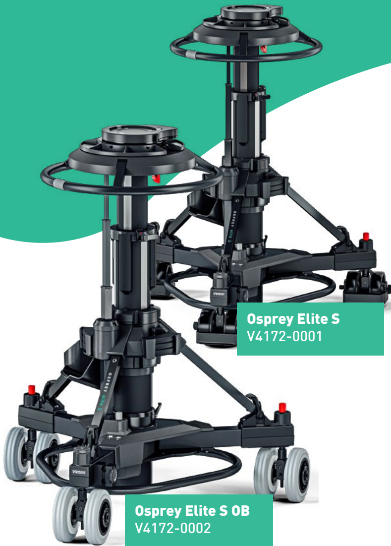
Osprey Elite S V4172-0001