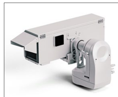
Enclosure installed on FHR-155E with extended cradle arm