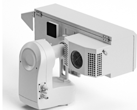
Enclosure with optional cooler module installed on FHR-155E with extended cradle arm