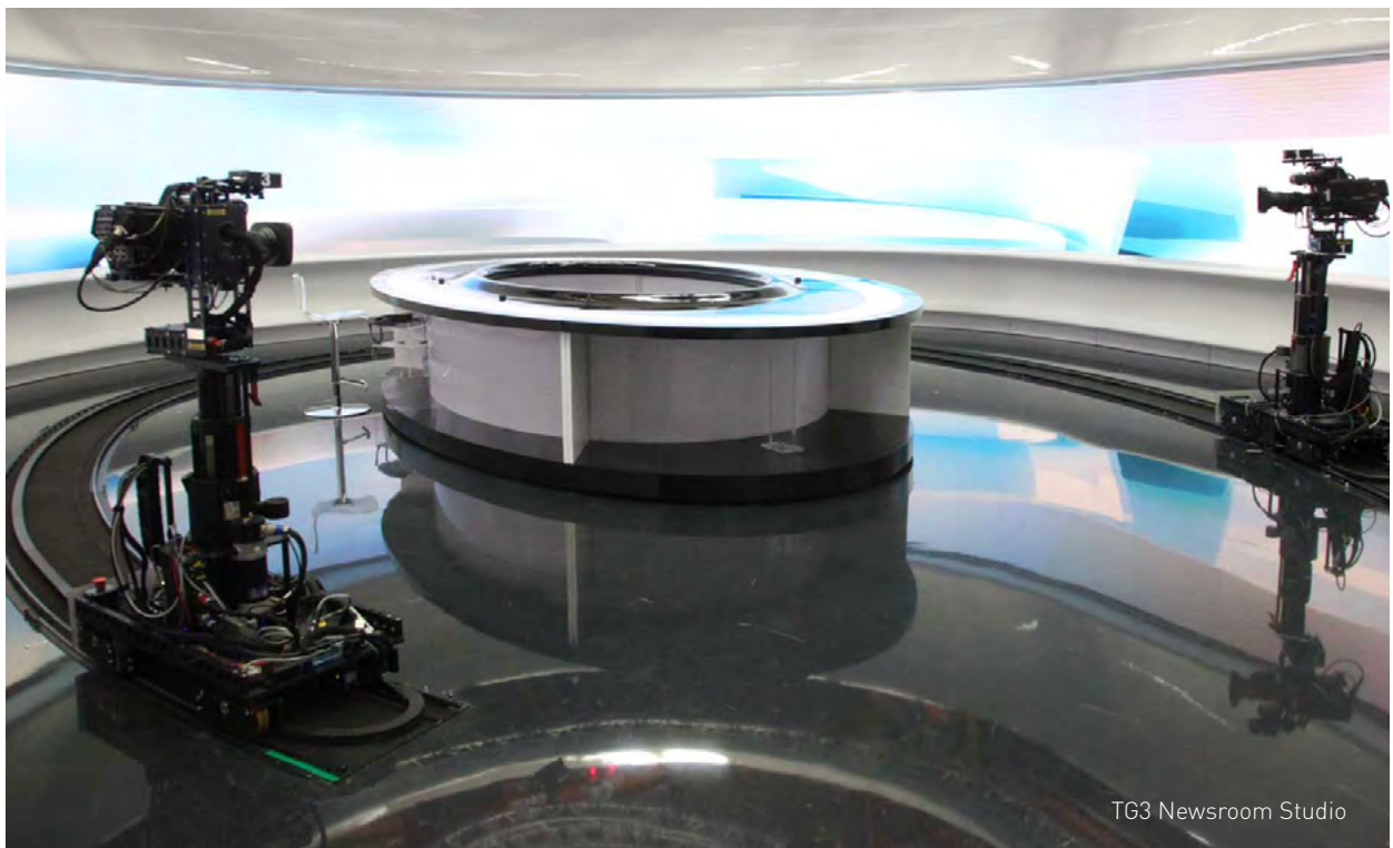
TG3 Newsroom Studio

TG3 chose the Hexagon Tracks because its unique cable management keeps the noise of the system low to non-existent. With the Hexagon everything is inside the track's width of 500 mm (19.68"), so no cables are outside the track; they are all housed in a small cable chain. And to maintain the quality of TG3's news programs, the dollies were also developed with automatic collision avoidance that prevents potential collisions when controlling the movement.