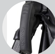
Carry handle S2051-1057