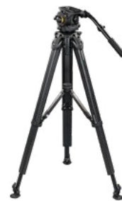
System Vision 8AS FT MS V8AS-FTMS