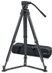
System Vision blue5 flowtech™75 GS