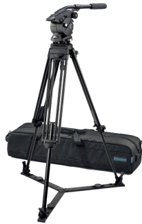
System Vision 8AS 2- stage AL PL MS SC