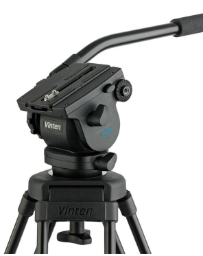
Vision blue Pan and Tilt Head