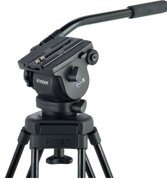
Vision blue3 Pan and Tilt Head