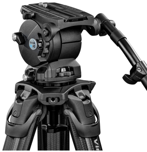
Vision 10AS Pan and Tilt Head