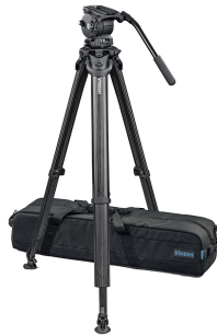
System Vision 8AS flowtech™ 100 MS