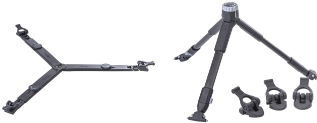
Heavy Duty Flexible Ground Spreader