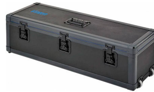
Hard Transit Case for EFP Systems