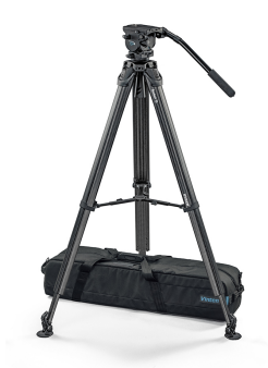
System Vision blue5 flowtech75 MS