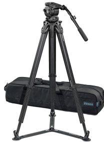
System Vision 10AS flowtech™100 GS