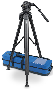
System Vision 100 flowtech™100 MS