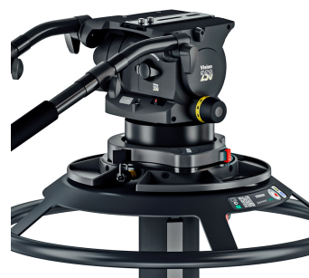
Vision 250F Pan and Tilt Head, Flat Base