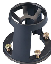
100 mm Levelling Bowl Adaptor