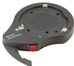
Heavy-Duty QUICKFIX Adaptor