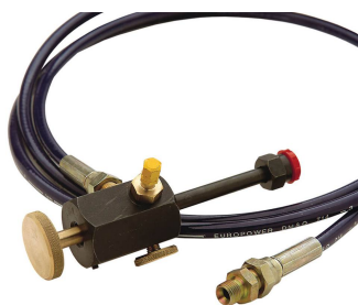
Nitrogen Charging Adaptor